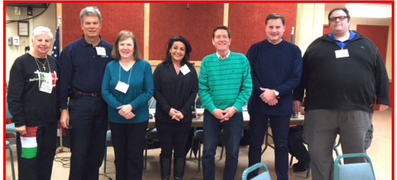
2016 Italian Club Officers