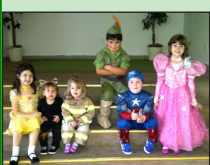
Kids in Costume