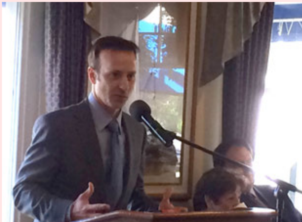
Guest speaker, Olympic gold medalist Brian Boitano.